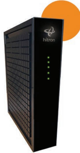
INTERNET MODEM (HITRON CDA3-20) ENGLISH